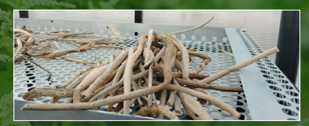
Figure 5: Dried stem using solar dryer.