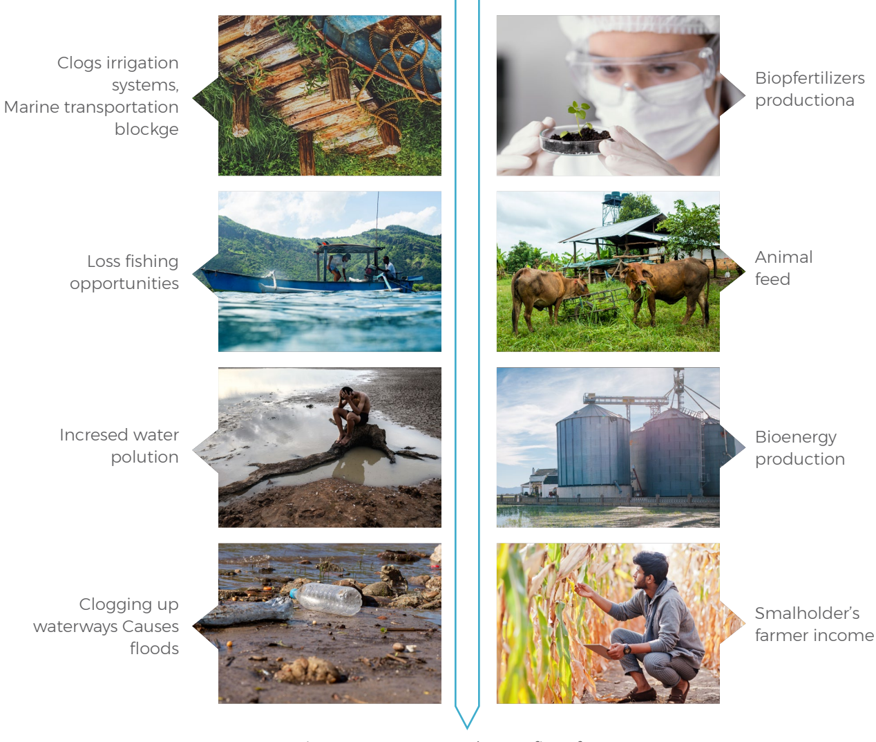
Figure 2: Impact and Benefits of Water Hyacinth